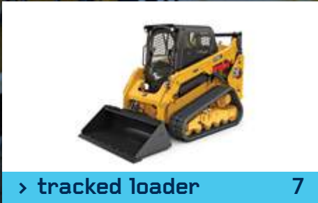
> tracked loader 7