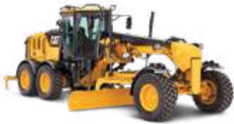
> graders 2