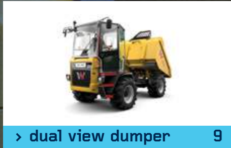
> dual view dumper 9