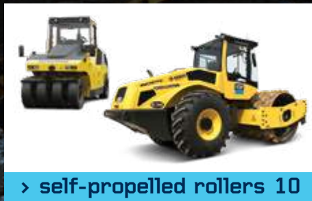
> self-propelled rollers 10