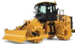
> compactors 4