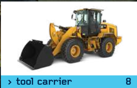
> tool carrier 8