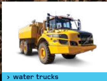
> water trucks