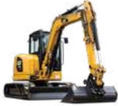
> excavators 1