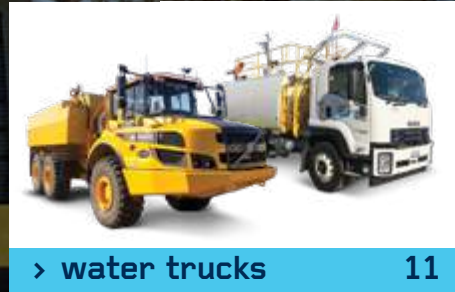
> water trucks 11