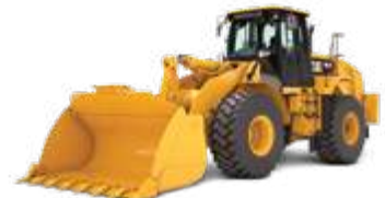
> wheel loaders 6