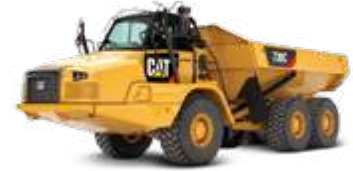
> artic dump trucks 5