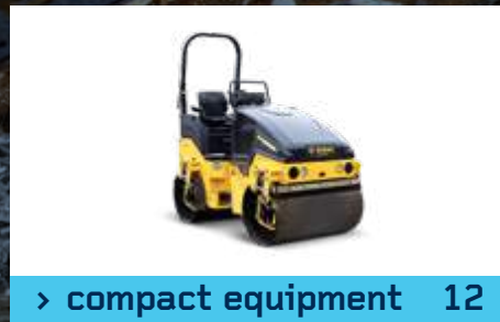
> compact equipment 12