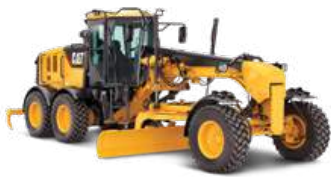
> graders 2