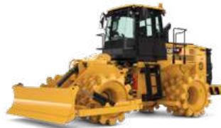
> compactors 4