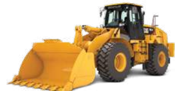
> wheel loaders 6