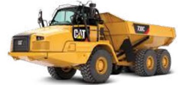
> artice dump trucks 5