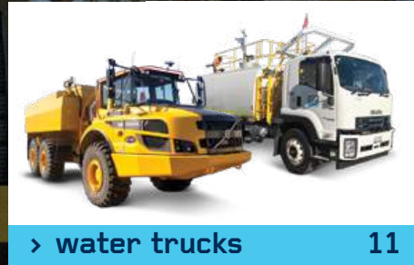
> water trucks 11