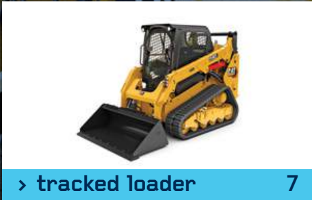
> tracked loader 7