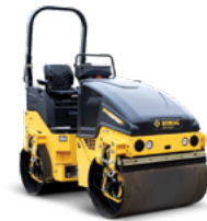
> compact equipment 12