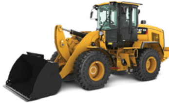
> tool carrier 9