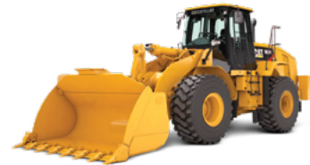
> wheel loaders 6