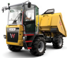
> dual view dumper 7