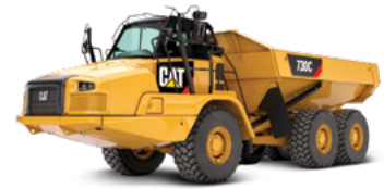
> artice dump trucks 5