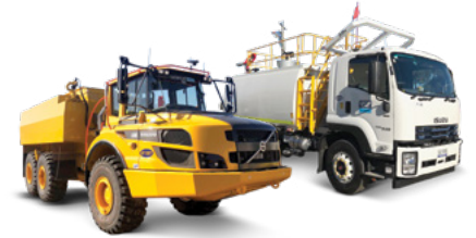
> water trucks 11