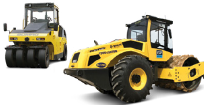
> self-propelled rollers 10