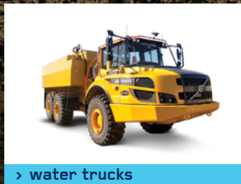
> water trucks