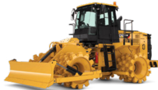
> compactors 4