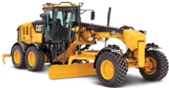
> graders 2