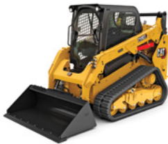
> tracked loader 8