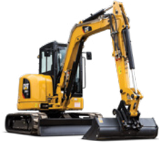
> excavators 1